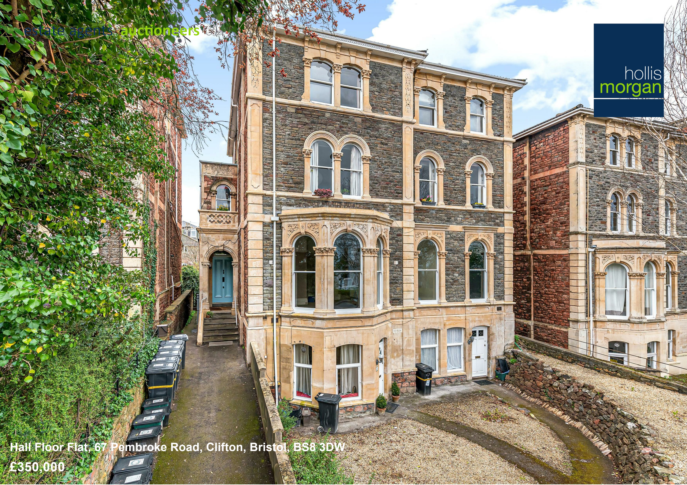
Hall Floor Flat, 67 Pembroke Road, Clifton, Bristol, BS8 3DW